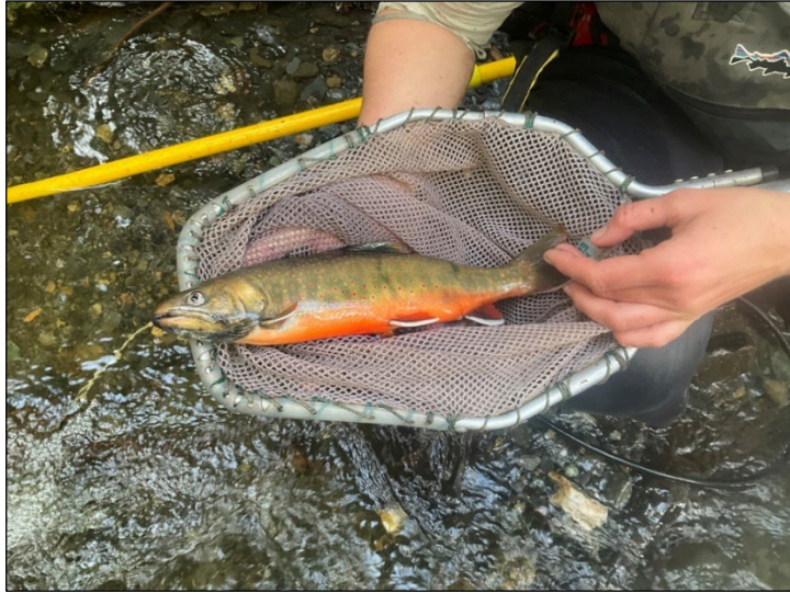
Figure 1.—Dolly Varden captured at waypoint 1014.