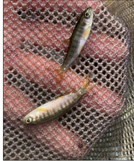
Figure 2.—Juvenile coho salmon captured at waypoint 1013.