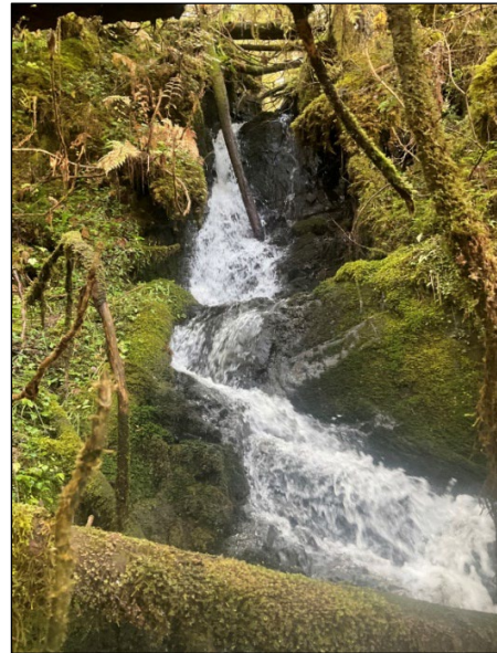
Figure 4.—Barrier falls at waypoint 1015.