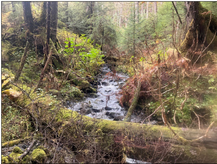
Figure 3.—Stream channel at waypoint 1011.